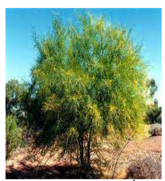
Fig no 1.parkinsonia aculeate<sup>6</sup>

Parkinsonia aculeata has a high tolerance to drought, simply attaining shorter stature. In moist and humus-rich environments it becomes a taller, spreading shade tree. This plant prefers a full sun exposure, but can grow on a wide range of dry soils (sand dunes, clay, alkaline and chalky soils, etc.), at an altitude of 0–1,500 metres (0–4,921 ft) above sea level.<sup>1</sup>