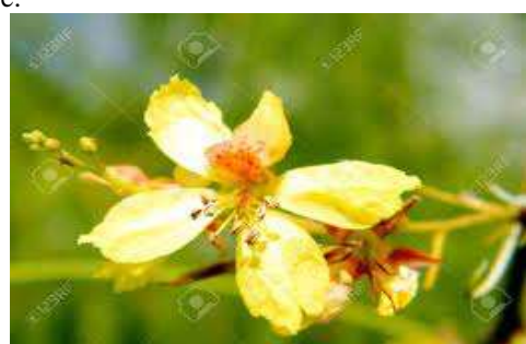
FLOWER OF P. ACULETA.24

Summer.<sup>23</sup> Flower clusters 7.5-20 cm long at leaf bases, unbranched; flowers several on long, slender stalks, irregular and slightly pea shaped, fragrant, showy, golden yellow, 2 cm or more across; calyx a short tube with 5 narrow yellow-brown lobes turned back; corolla of 5 nearly round petals 10-13 mm long, yellow tinged with orange and hairy at base.<sup>20</sup>