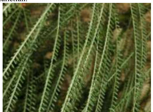
LEAVES OF P.ACULETA.<sup>22</sup>

Leaves specialized, alternate, bipinnately compound, consisting of very short axis ending in spine 1-2 cm long, and 1 or 2 pairs of long, yellow green drooping side axes, strips or streamers 20-30 cm long and 3 mm broad, flat and slightly thickened; each strip with 20-30 pairs of thin, oblong, green, small leaflets 3-5 mm long, which shed early; strips resembling a blade of grass continue functioning as leaves after leaflets fall. <sup>20</sup>They consist of 1 or 2 pairs of 1-2 cm long spiny ended axis. They resemble a blade of grass and continue functioning as leaves after leafletfall. <sup>18</sup>