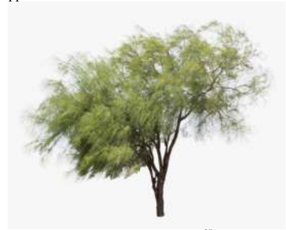
Parkinsonia Aculeata. 19

Jerusalem thorn is a small tree growing to 25 ft tall with a short trunk and a graceful, spreading, sometimes weeping, crown to 20 ft. wide. Jerusalem thorn has peculiar strap like, twice compound leaves that look like long, feathery streamers. To Grow up to 4-10 m height with a very short and often corked trunk up to 40 cm in diameter. It remain green throughout the year and appears leafless after leaflets fall. 18